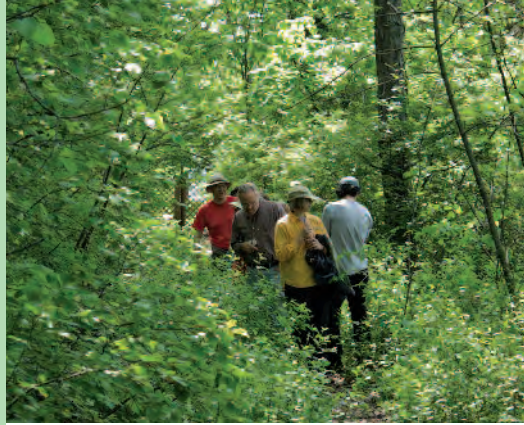
Preserving Wally Bauman Woods was the Land Trust's first success.

The Natural Heritage Land Trust protects natural areas, wildlife habitat, working farms, healthy lakes and streams, and recreational land to provide a high quality of life in the Dane County region.